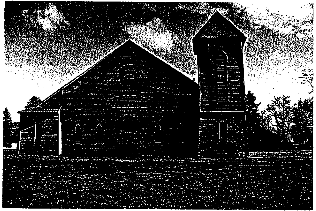
The Tabernacle around the turn of the century (Below)